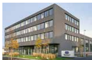
Headquarters of the WAB-GROUP

Junkermattstrasse 11 P.O. Box 944 4132 Muttenz 1 Switzerland Tel. +41 61 6867-100 Fax +41 61 6867-110 wab@wab-group.com www.wab-group.com