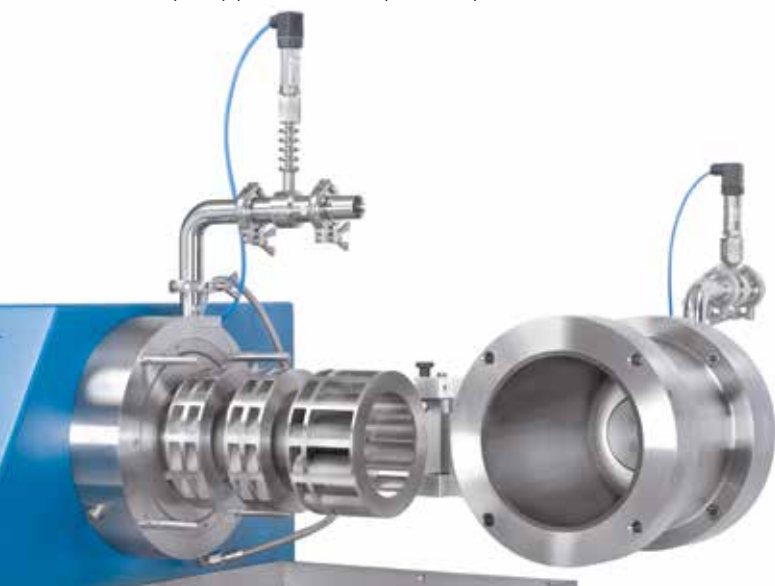
DYNO®-MILL ECM-AP 10

For decades, WAB has been a leading specialist in the field of grinding and dispersion with thousands of the world famous DYNO®-MILL products installed worldwide. The many products that are required to be milled demand contact material of the highest quality. With its extensive program of mills and experience gained over decades, WAB delivers the right solutions for all machines and products to ensure that you produce the finest quality products in a repeatable process.